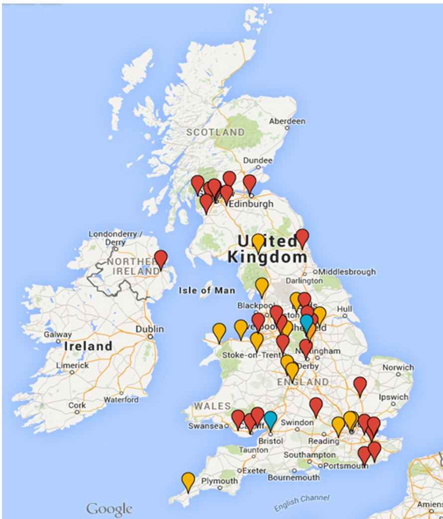
Wave 2 sites Initiated—not yet open Open

We have opened a total of 33 sites, which completed Wave 1. Wave 2 site initiations have begun and further sites will be opening very soon. Wave 2 is split into A & B with 10 sites in each.