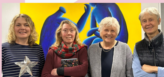
The SHORE-C Team at Sussex University

"As a former breast cancer patient, I gained a passion for involvement in research studies as a patient advocate. My first entry into this exciting field was with the POSNOC study in its early days and I have been a member of the research team ever since. My focus is being available as a person with lived experience, to answer any relevant questions that may come up from time to time, also to make sure patient facing documentation is sympathetic to the patient's needs at the time of potential stress. POSNOC was for me an ideal starting point, in that the study is very relevant to breast cancer patients. The study aims to find out if it is really necessary to remove lymph glands from the armpit, which has been a standard practice for many years. I myself had many lymph glands removed to see if any tiny cancerous cells were present, which they weren't. The POSNOC team is a group of dedicated researchers and staff and I am only too happy to be on the team!"